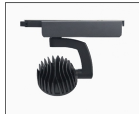
Mezzo M Horizontal Tracklight (24W-27W COB)