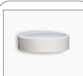
Zeta-S 20W Panel Downlight