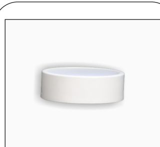
Zeta-S 15W Panel Downlight