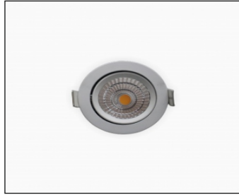
Mezzo 8W Tilttable Fixed Downlight (6W-8W COB)