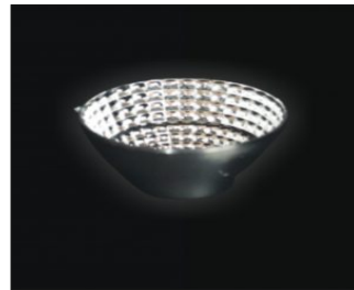
52MM K Reflector