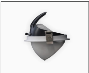
Harris Zoom Wall washer (28W-36W COB)