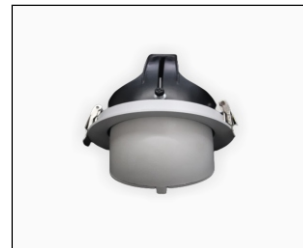
Harris Zoom Wall washer (28W-36W COB)