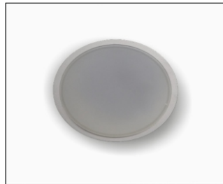
Zeta-R 20W Panel Downlight