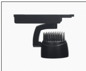
Kyma Horizontal Tracklight (28W-36W COB)