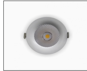
Mezzo L Fixed Recess Downlight (27W-40W COB)