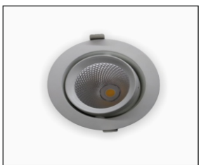
Kyma Tilttable Recess Downlight (28W-36W COB)