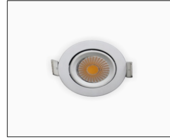
Mezzo 5W Tilttable Fixed Downlight (3W-5W COB)