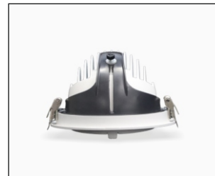
Harris Zoom Wall washer (28W-36W COB)