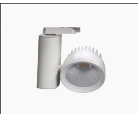
Kyma Vertical Tracklight (28W-36W COB)