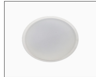
Zeta-R 24W Panel Downlight