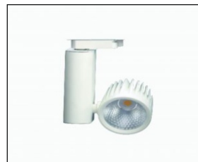
Mezzo M Vertical Tracklight (24W-27W COB)