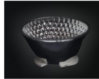
75MM K Reflector