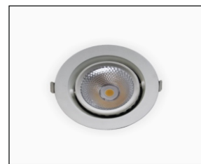
Mezzo L Tilttable Fixed Downlight (27W-40W COB)