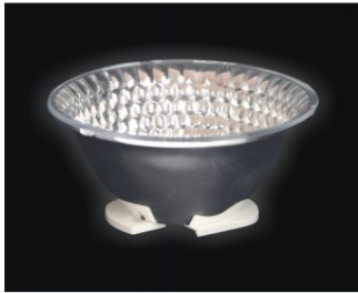
85MM K2 Reflector