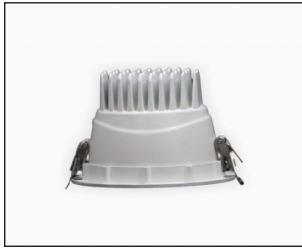
Kyma Fixed Recess Downlight (28W-36W COB)