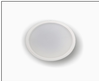
Zeta-R 15W Panel Downlight