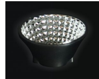
30 MM K Reflector