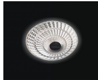
41MM K Reflector