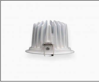
Mezzo 12 W Tilttable Downlight (9W-12W COB)