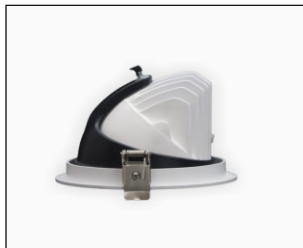
Harris Zoom Wall washer (28W-36W COB)