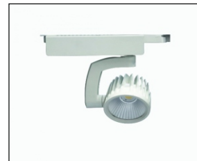
Mezzo S Horizontal Tracklight (18W-20W COB)