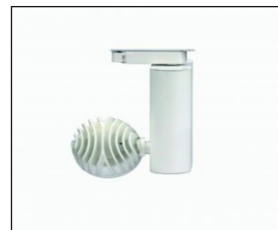
Mezzo S Vertical Tracklight (18W-20W COB)