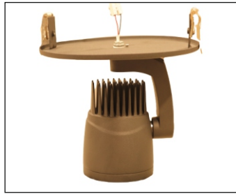
Kyma Semi Recess (28W-36W COB)