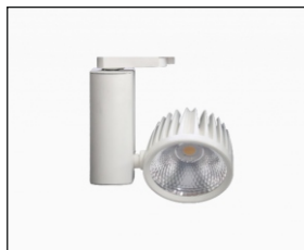
Mezzo L Vertical Tracklight (27W-40W COB)