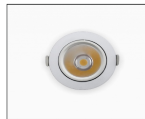
Mezzo S Tilttable Fixed Downlight (18W-20W COB)