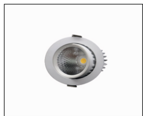
Mezzo M Tilttable Fixed Downlight (24W-27W COB)