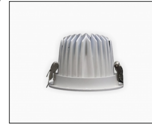
Mezzo M Fixed Recess Downlight (24W-27W COB)