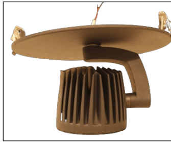
Mezzo L Semi Recess (28W-36W COB)