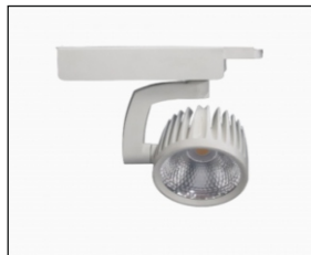
Mezzo L Horizontal Tracklight (27W-40W COB)