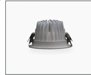
Mezzo S Fixed Recess Downlight (18W-20W COB)